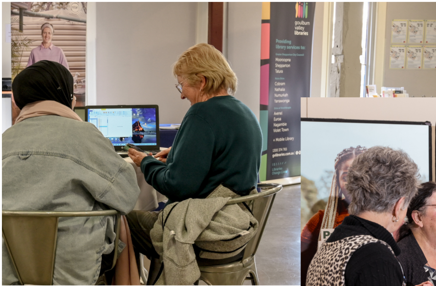
Rural Women Online Greater Shepparton