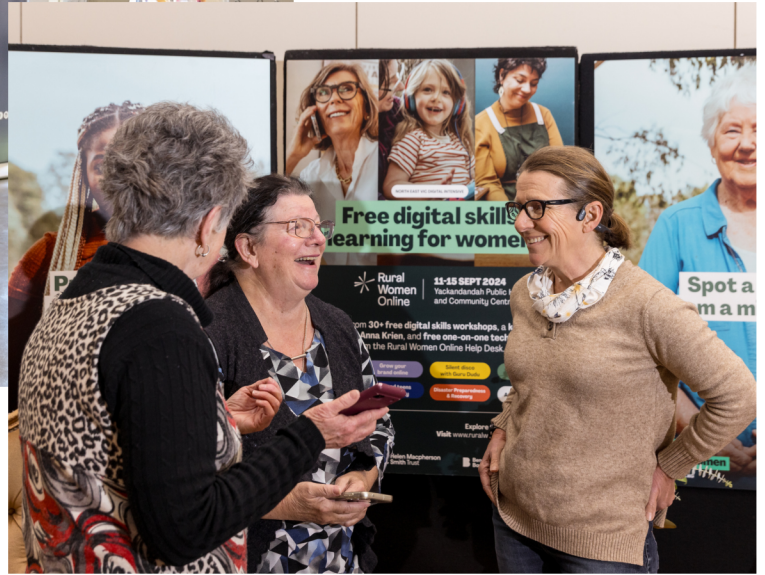
Rural Women Online North East Victoria