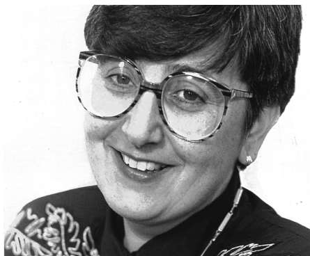
LOULA RODOPOULOS SUB-FUND

This project will train single mothers to advocate for themselves and their children to shift public policy and the narrative of single mothers. With training and peer-support single mothers can improve financial, safety and social outcomes for their families. This approach will enable single mothers to address the entrenched disadvantage single mothers and their children face in the media, their communities and public policy.