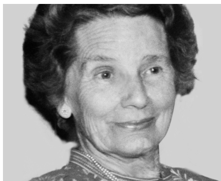
JOAN HUDSON SUB-FUND

Council of Single Mothers and their Children Inc. Single Mothers Speak Out $8,530