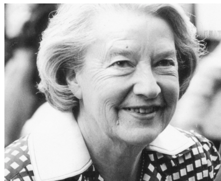
JEAN MCCAUGHEY SOCIAL JUSTICE SUB-FUND

Global Reconciliation will partner with African Family Services (AFS) to run two leadership workshops. AFS provide African women with a safe space to share their stories and experiences. The project will prepare the women to manage the mental and emotional pressures of both family and work life in Australia, further developing their skills as leaders in their community.